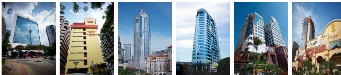
Bangunan AmBank Group ('BAG') AmBank Group Leadership Centre ('AGLC') Menara AmBank ('MAB') Menara Merais ('Merais') Kelana Brem Towers ('KBT') The Summit Subang USJ ('Summit')